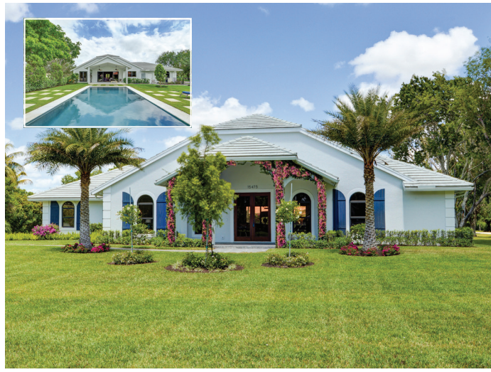
AERO CLUB ESTATE | $1,450,000 | If hopping on a jet in your own backyard sounds like a dream come true, it's time that you make your move to this fabulous, beautifully renovated 3 bedroom, 3.5 bathroom home at Wellington Aero Club. The property offers the unique opportunity to build your own hangar for your jet, and features its own personal taxiway lot. Golf cart distance from the world-famous equestrian showgrounds.