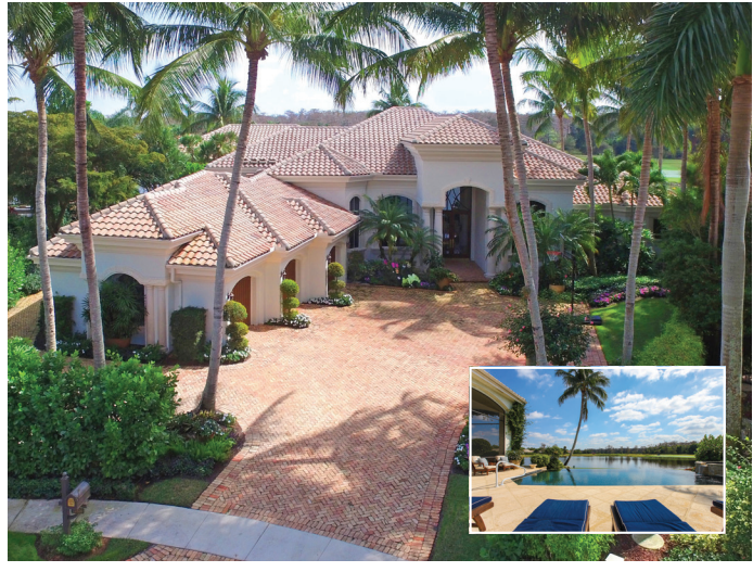
LUXURY HOME IN MIZNER ESTATES | $3,200,000 | This secluded estate home features the best view in Palm Beach Polo. With an infinity edge pool that seamlessly blends with views of the lake, golf course, and the 92-acres wildlife Preserve, the 4 bedroom 5.5 bath home features pocket glass sliders in the kitchen and family room that allow for an outstanding indoor/outdoor living experience. The full-length frameless windows bring light, openness and sophistication to this opulent residence.