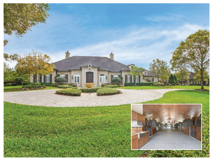
CHATEAU-INSPIRED EQUESTRIAN ESTATE | $7,950,000 | This stunning chateau-inspired estate sits on 5.44 acres and boasts a large covered patio with a summer kitchen and an infinity pool. For equestrians, the property delivers in all regards with 5 turnout paddocks, a 120x230 foot all-weather Riso arena, a walker, and a fully-equipped 12-stall stable with a new storage building.