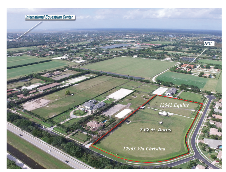
12963 VIA CHRISTINA | $3,072,000 | 12542 EQUINE LANE | $1,500,000 | Located within one of the premier guard gated equestrian communities, Grand Prix Farms provides a unique way of life with a luxurious ambiance. Build your own custom designed equestrian estate. Site ready to build with all underground utilities including drainage, city water & sewer, natural gas, phone, and cable with high speed internet.