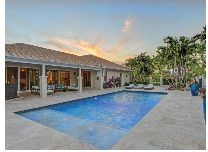
PALM BEACH POINT ESTATE | $5,400,000 | An ideal blend of rustic and Mediterranean styles, this beautiful estate sits on 5.4 meticulously landscaped acres. The completely redone home boasts a split bedroom floor plan, a covered patio with summer kitchen and pool, a 135'x230' riding arena, 7 paddocks, and an 8 stall center aisle barn.