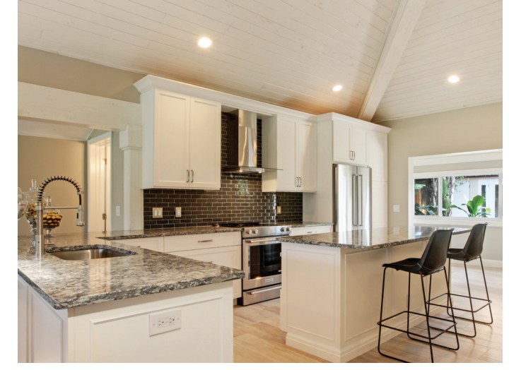
PALM BEACH POLO & CC | EAST LAKE BUNGALOW | $749,000 | With both IPC and the Palm Beach International Equestrian Center close by, this newly-renovated home falls nothing short of phenomenal. The property is complete with a 1 bedroom/1 bath guest cottage and a 3 bedroom/2.5 bath main home, in which everything is new, including impact windows and doors, custom-built kitchen and cathedral wood ceilings.