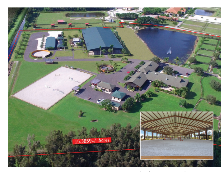
PROFESSIONAL EQUESTRIAN FACILITY | $7,750,000 | Fabulous professional equestrian facility on 15+ acres, only minutes from WEF. Brand new immense covered arena with GGT footing, outdoor GGT all weather ring, grand prix field, plus a walker and round pen. 42 stalls & 18 paddocks, roomy owners & staff quarters, all overlooking a beautiful lake with lovely western views.