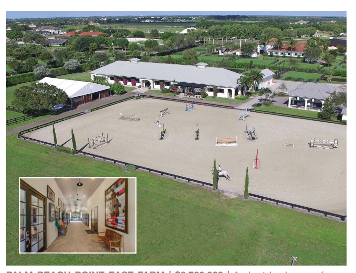
PALM BEACH POINT EAST FARM | $6,700,000 | A short hack away from PBIEC, this incredible 10-acre farm is fit for any professional rider. The 12-stall center-aisle stable, complete with the finest amenities, recently underwent a full renovation, leaving it totally updated and ready for the new season. The property features a spacious owner's lounge with full kitchen and 2.5 bathrooms, a large grand prix field and a new ring with top-grade fiber footing.